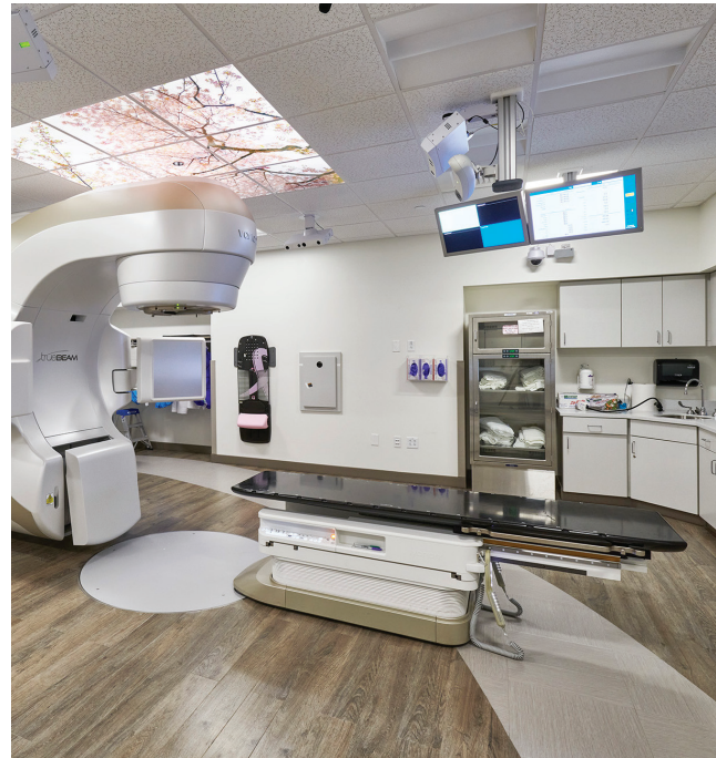
True-Beam Linear Accelerator

Thank you for your donations that ensure your friends, neighbors or maybe even you, are able to get advanced, comprehensive and convenient care close to home.